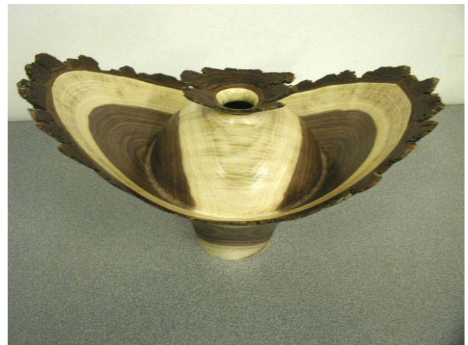
An unusual natural edged bowl made by Tip House